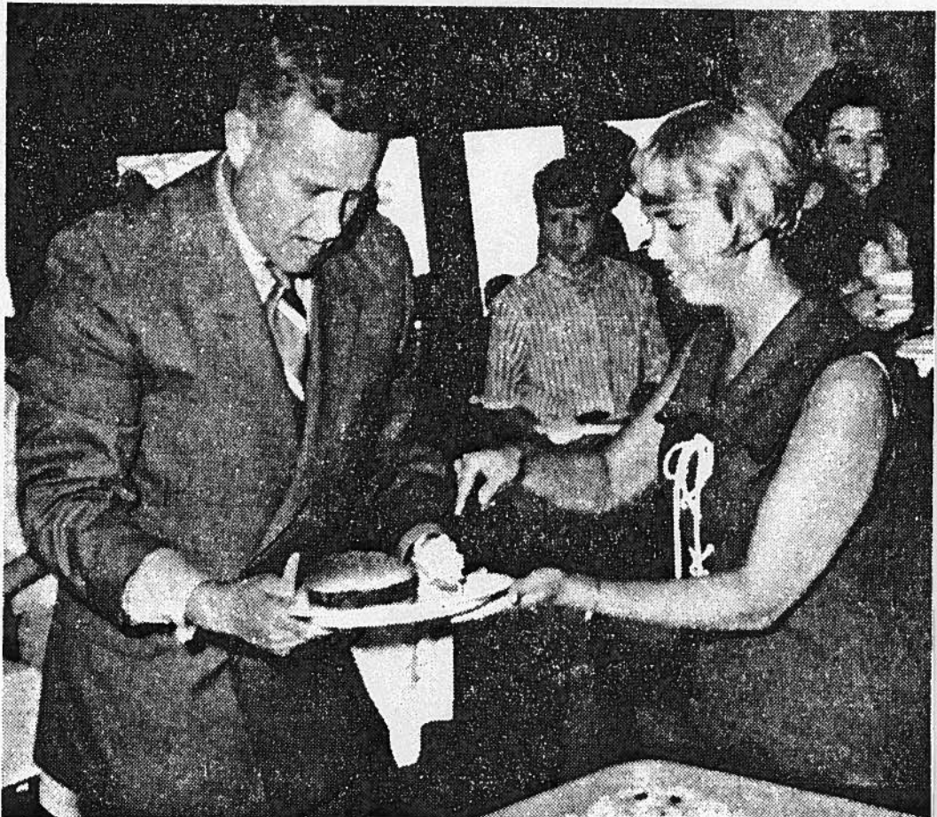
Gov. Tom McCall samples fare